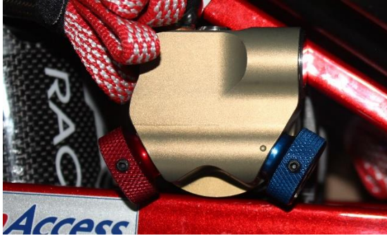
Lock-out (Lift riding) position

You can lock your position by turning the red lock-out knob clockwise \frac{1}{4} turn (see photo left) and lift up using outriggers (or with help from your ski buddy). The frame then stops at the top position.