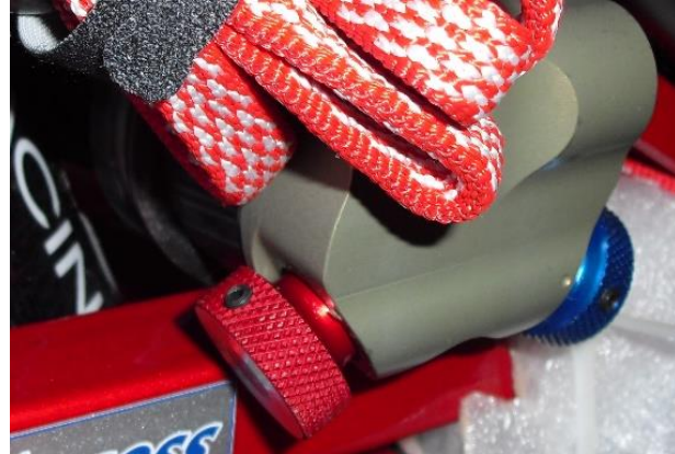
Up and Go (skiing) Position

You can lock your position by turning the red lock-out knob clockwise \frac{1}{4} turn (see photo left) and lift up using outriggers (or with help from your ski buddy). The frame then stops at the top position.