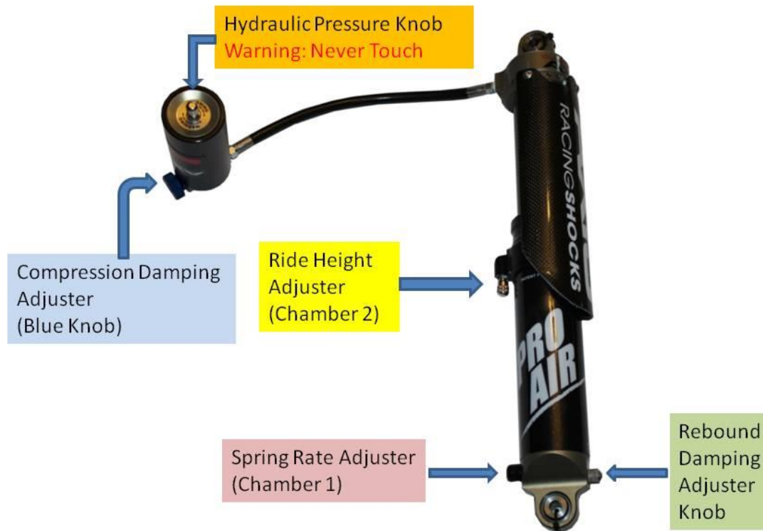
Fig. 1 Locations of shock adjusters

In essence, spring stiffness is controlled by the air pressure in the lower chamber (Chamber 1) whereas ride height is controlled by the air pressure in the upper chamber (Chamber 2). The air pressure of both chambers can be changed by the enclosed air pump (bicycle shock pump). The compression and rebound dampings are adjusted with two or three knobs (depending on whether a double-adjustable or triple-adjustable shock is used).