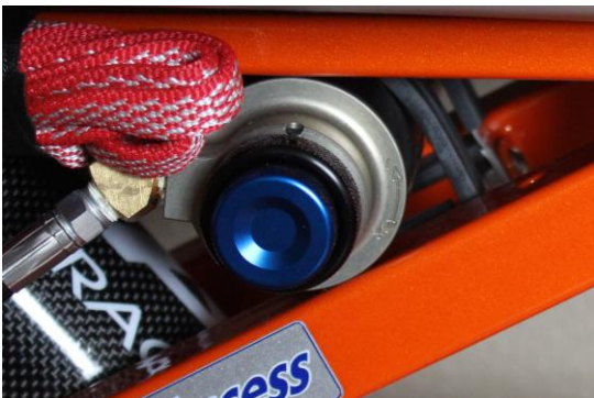
Fig. 4 The knobs for adjusting high speed and low speed compression damping are located on the remote reservoir. The big black knob is for adjusting high speed compression damping and the small blue one is for low speed compression damping

A triple adjustable shock is equipped with a rebound adjuster plus a high speed and a low speed compression knob. The large black knob is for adjusting high speed compression damping and the smaller blue one is for low speed compression damping. High and low speed here means “shaft speed”, i.e., how fast the shock is compressed. It has nothing to do with how fast you ski. For example, landing after a jump compresses the shock quickly and the response will be governed by the high speed compression knob. Skiing at high speed over “rollers” compresses the shock slowly and the low speed compression knob governs this range.