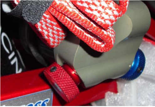
Fig.6 Up and Go (skiing) Position

When on the lift the red knob can be turned back (up –counterclockwise) \frac{1}{4} turn. In case the skier forgets, there is a blow-off bypass valve to reduce the pressure that works when you jump off the lift. However, make sure to turn the knob to the skiing position before you ski.