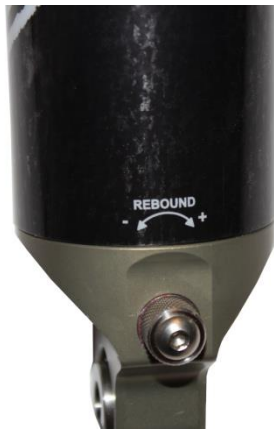
Fig.2. Knob for adjusting rebound damping.

During successive runs, try to adjust the rebound knob so that the rebound is as fast as possible (low rebound damping) without feeling uncontrolled. Further, you may want an assistant to watch you riding off a 4"-6" jump and adjust the rebound so that the monoski bounces just once.